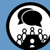
Training and Consultancy