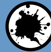
Blood Pattern Analysis