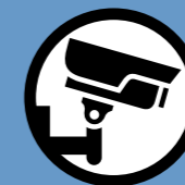
Video Enhancement & Image Analysis