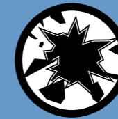
Glass, Paint and other Particulates