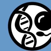
Specialist DNA Services