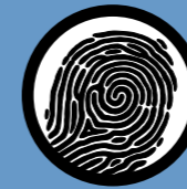
Enhancement and Recovery of Latent Marks